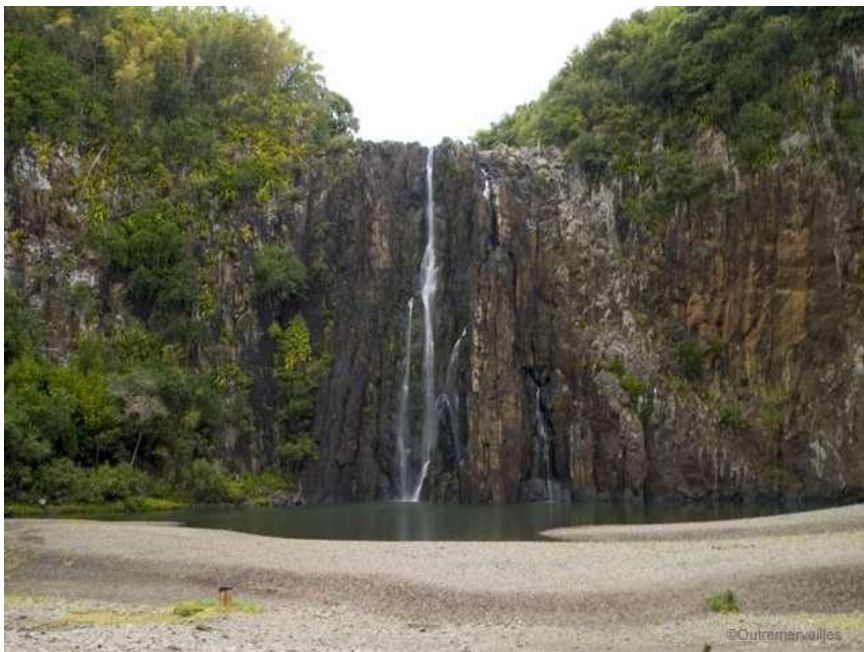
Niagara waterfall at sainte-clothilde